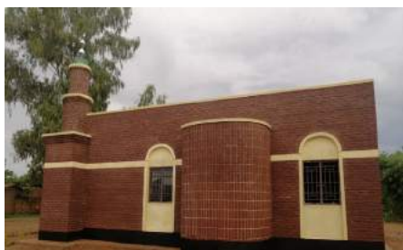
Nchisa Village, Balaka District

In several districts across Malawi, there are many Muslims who do not have access to a proper place to perform their prayers, which can be a significant challenge. Thankfully, Dedza Welfare Trust UK and Islamic